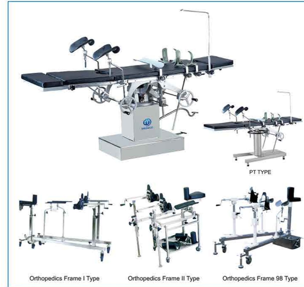
Table height: 800mm~1045mm Length and width: 2100mmx480mm Reversed Trendelenburg: 35° Trendelenburg: 20° Left inclining angle: 22° Right inclining angle: 22° Upward folding angle of back rest: 75° Downward folding angle of back rest: 22° Upward folding angle of head rest: 90° (Dismountable, extendable) Downward folding angle of head rest: 90° Downward folding angle of leg rest: 90° (Dismountable) Oil pump range: 240mm