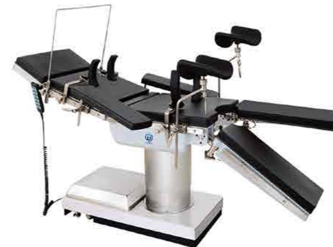
Electric Operating Table ECOH003-C

The super low level design can enable doctor to conduct operation sitting by operating table. Adopt electric hydraulic double cylinder elevating with stable performance. Import motor and Electromagnetic valve. Imported sealing ring and is durable. The base seat and upright column covering are made of high quality 304 stainless steel which is anti-corrosive and can be easily cleaned. Electric braking control which is easily for moving operating table.