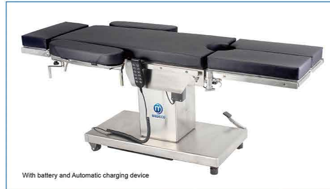
With battery and Automatic charging device