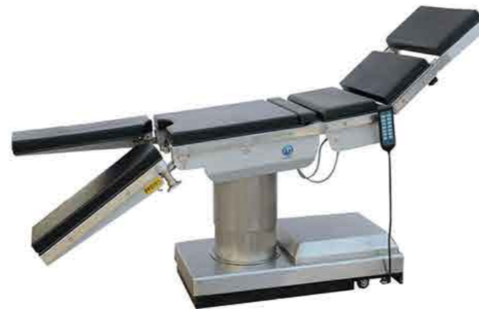
Electric Operating Table ECOH002-B

Table height:500mm~850mm Length and width:2000mmx600mm Reversed Trendelenburg/Trendelenburg: 15^\circ Lateral Tilt (Left/Right): 20^\circ Head rest(up/down): 20^\circ / 90^\circ