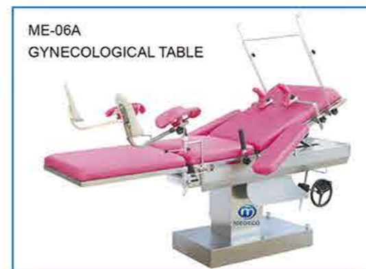
ME-06A GYNECOLOGICAL TABLE

Stainless steel, hydraulic lift Table height: 750mm~990mm Length and width: 1900mmx600mm